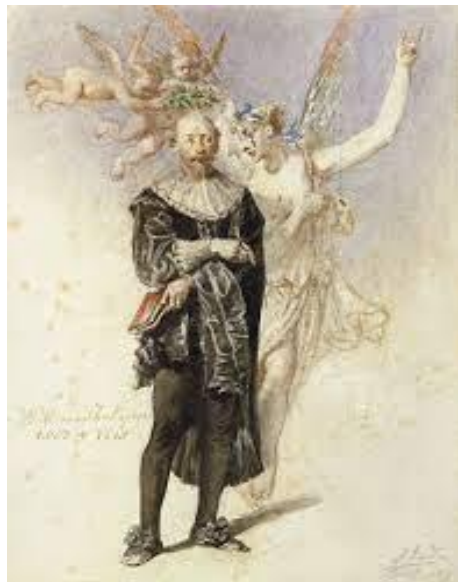
Figure 2. William Shakespeare [with a winged muse and two cherubs which hold a crown of laurel]. Alexandre Bida (1893).