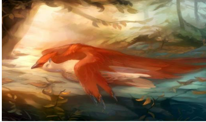
Figure 5. The Phoenix and the Turtle. The Phoenix is a symbol of the Cosmic Fire of the Divine Soul. The turtledove in the phoenix's embrace is a metaphor for the human soul. The image of the turtledove and phoenix is inspired by the Shakespearean poem.

Verse 1 Let the bird of loudest lay On the sole Arabian tree Herald sad and trumpet be, To whose sound chaste wings obey.