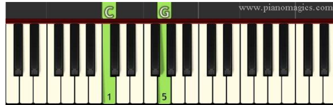
Figure 3. Piano Keyboard showing a perfect fifth.

This pattern recognition ability of the human brain is most relevant here. John Beaulieu (2016) in his paper “The Perfect Fifth: The Science and Alchemy of Sound” has related the healing ability of music to the presence of a perfect fifth. The interval of a perfect fifth in music can be readily seen since it refers to five white notes apart on the piano keyboard, for example C to G. See Figure 3.